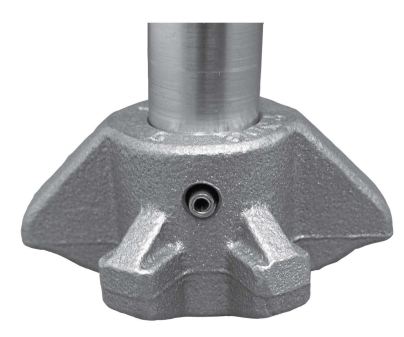
Figure 1: Pin connection for Advantage actuator

To determine if you have an Advantage actuator or an Advantage actuator 2.0 locate the spindle compressor connection and determine if you have a pin or t-slot connection.