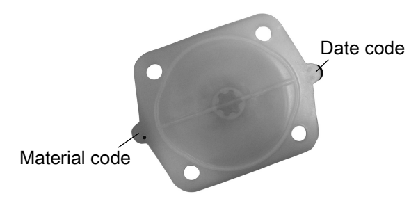
Figure 6: PTFE diaphragm