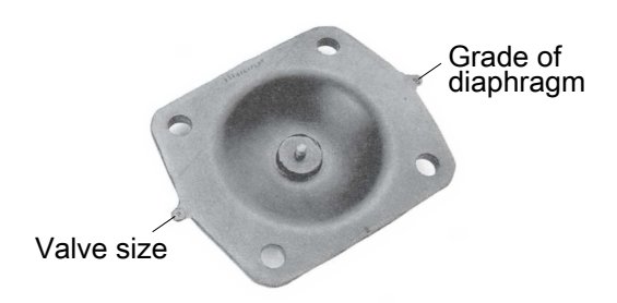
Figure 5: Elastomer diaphragm back